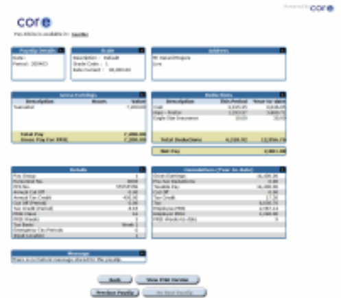
Example of On-Line Payslip

Primark management selected CorePay based on the solutions second to none track record in catering for the unique requirements surrounding UK and Irish payroll. CorePay complies with both UK and Irish payroll legislation and is updated in line with changes as they occur CorePay is a "State of the Art" interactive Payroll solution offering comprehensive pay facilities that help you control your payroll inputs, increase user productivity and capture critical Payroll information. Core's integrated Internet solutions allow employee online access to critical information such as pay history, holidays, hours worked, tax details and payslips. In addition CorePay provides extensive user reporting through the CorePay Business Intelligence module.