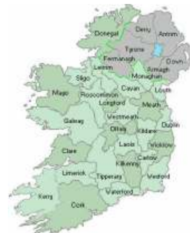
Map Displaying Counties of Ireland

Core will provide the County and City Councils with a complete end-to-end solution to their HR needs, catering for every aspect of the employee life cycle, from initial recruitment through to eventual retirement. The County and City Councils will benefit greatly from Core's extensive support structure, on and off site training facilities and tried and tested user group set up.